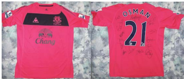
The shirt is signed on the back. It does not show very well on a printed newsletter.